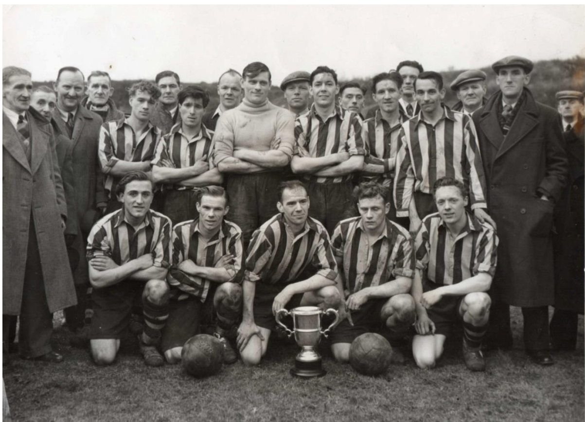
South Shields Sunday Football League Cup